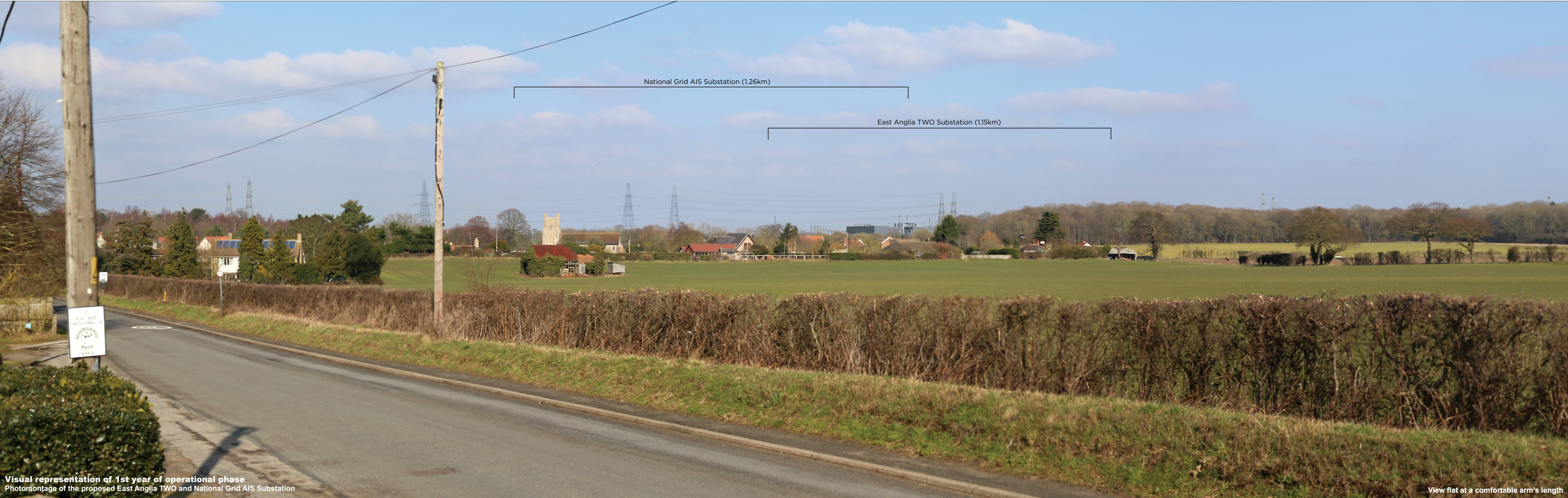
Visual representation of 1st year of operational phase Photomontage of the proposed East Anglia TWO and National Grid AIS Substation